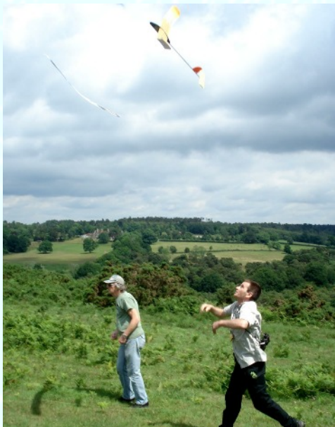
Alex launches Gary's F1H

Warm with cloud & a little rain at times. 10 to 12 mph SW breeze.